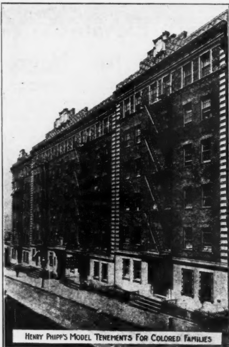
HENRY PHIPPS' MODEL TENEMENTS FOR COLORED FAMILIES